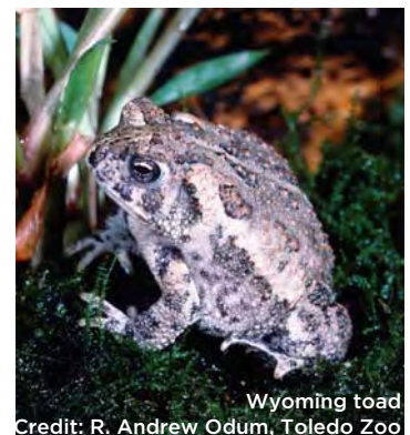
Wyoming toad

The Wyoming toad suffered dramatic declines until 1994, when it was officially listed as Extinct. Fortunately, AZA-accredited zoos and aquariums, in partnership with federal and state government partners, had already established ex-situ populations and now release Wyoming tadpoles and toadlets back into the wild. U.S. Fish and Wildlife Service also manages summer field surveys, which includes participation by members of AZA's Wyoming Toad Species Survival Plan® (SSP) program. Learn more about the Wyoming Toad SSP at: www.wyomingtoad.org/ .