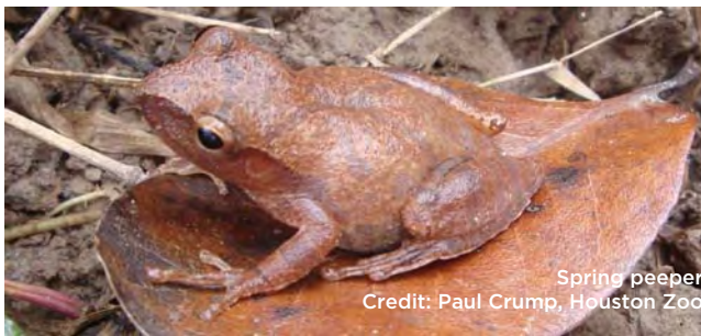
Spring peeper

This Summary Report reflects data from both 2008 and 2009. Thanks to all the dedicated volunteers!