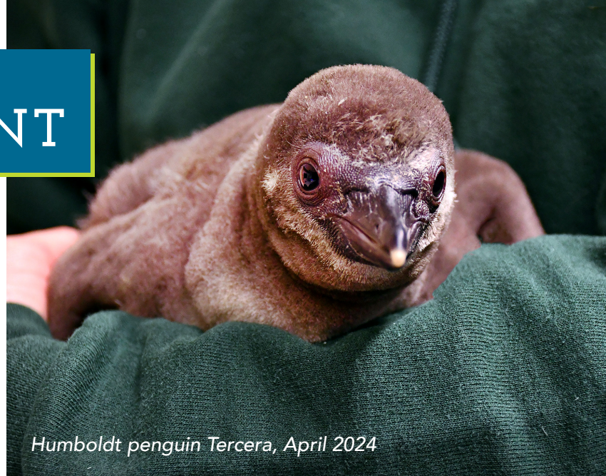
Humboldt penguin Tercera, April 2024

Your Akron Zoo has had a busy year and we couldn't be more proud of what we have accomplished. We celebrated the birth of a Humboldt penguin chick in March, who came to the zoo as an egg from the Columbus Zoo and Aquarium. It was deemed a high priority in terms of genetic diversity and the decision was made by the Humboldt Penguin Species Survival Plan (SSP) to send the egg to the Akron Zoo. This collaboration is a wonderful example of AZA institutions working together for the benefit of an endangered species.